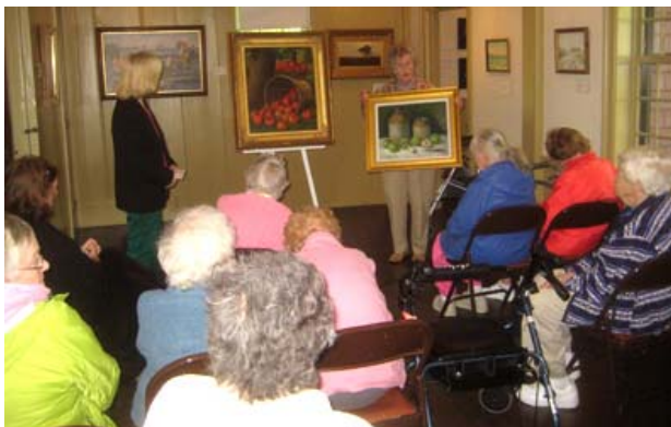
Arts and Alzheimer's