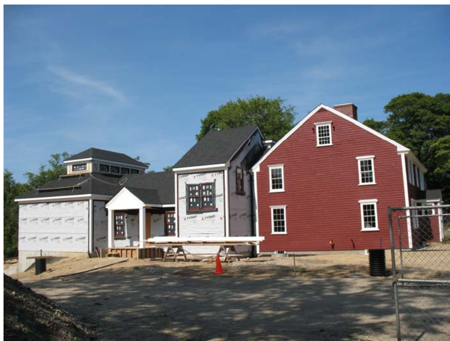
Our original 1775 building getting spruced up and enlarged.

For assistance or additional information about making an endowment gift in any amount, please contact us at rwaterhouse@cahoonmuseum.org .