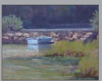
Betsy Payne Cook, Blue Dinghy , 2014, pastel, 9x12 inches, on view in the Small Works exhibit from Dec. 2 through Dec. 24