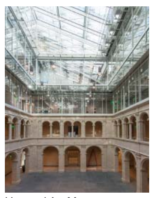
Harvard Art Museums