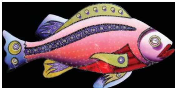
Carl Lopes, Rock Fish 5 , mixed media on panel, on view in The Lure of the Fish exhibit through July 20.

At the Mashpee Commons temporary location, the Cahoon Museum of American Art is presenting two outstanding exhibitions for the summer. From June 10 to July 20, 2014, “The Lure of the Fish” will be on view. From July 22 – September 7, 2014, the museum will present “Making Faces.”