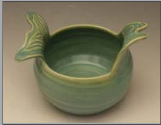
Shelley Fenily, Fish Bowl , on view in The Lure of the Fish exhibition through July 20.