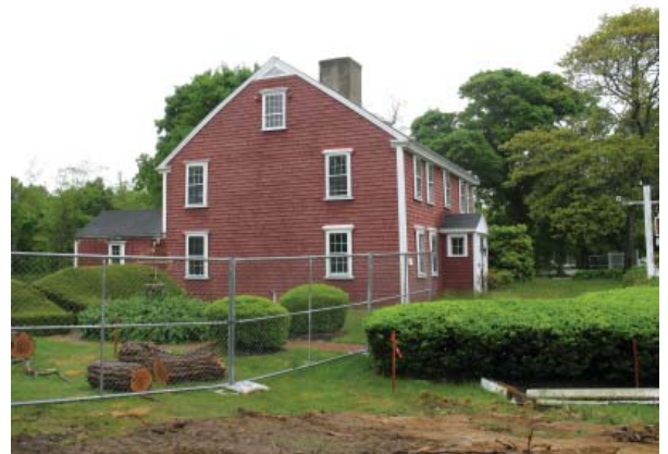
Beginning the renovations to the building and grounds.

After the site work is completed, Cape Cod Associates, Inc., who won the contract for the renovation, will begin the work.