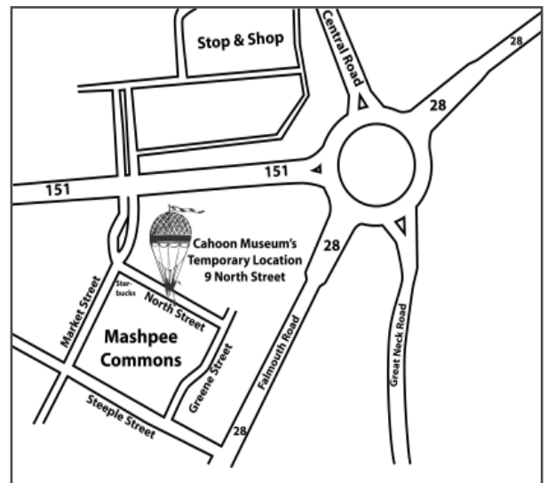
Come join us at our temporary location at 9 North Street in Mashpee Commons.

The first part will be to totally repair and conserve all the windows in the old building. The process will include taking out many of the windows and conserving them off site.