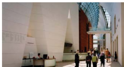
Entrance to the atrium of the Peabody Essex Museum in Salem, Mass.

Minimum attendance is 25. Please register by July 29.