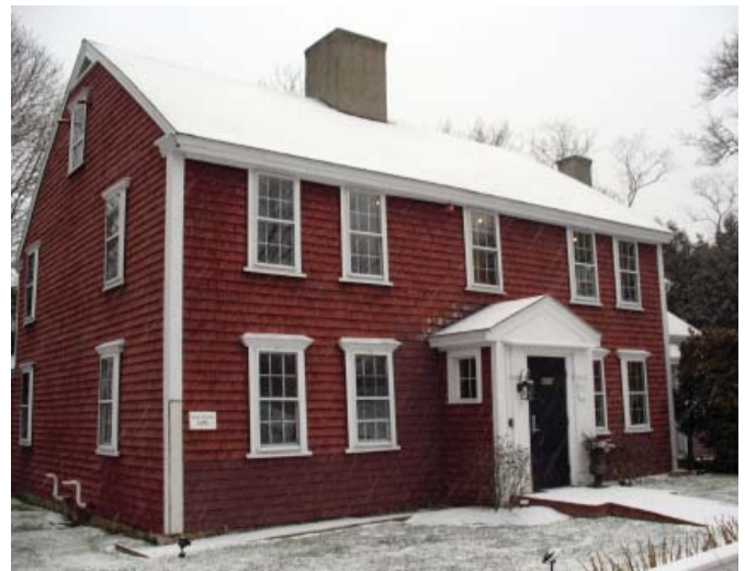
The Cahoon Museum of American Art in December's light snowfall.