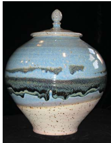
Kevin Nolan's pottery jar will be one of the items included in the raffle.

Tickets are limited, so please pre-purchase your tickets by calling (508) 428-7581 or emailing christy@cahoonmuseum.org