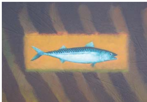
Kevin King, Holy Mackerel XVI , oil and mackerel ash on panel, Permanent Collection of the Cahoon Museum, will be on view in The Lure of the Fish