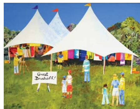
Doris Mee, The Great Brush Off , 2013, mixed media collage

If you want to volunteer to help with this event, please contact Len Carter at carterhouse64@aol.com .