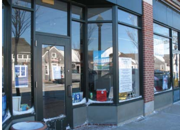
Cahoon Museum's new temporary location at 9 North Street in Mashpee Commons

The first step in the move will be to put together an “institutional memory committee”—consisting of Rosemary Rapp, Barnes Riznik, Jason Eldredge and myself—that will help to identify not only what should be moved to our temporary space, but also which items, especially in the attic and garage, should be packed and put in storage and which should simply be discarded. For example, both in the garage and in the attic, there are many pedestals and plexi-glass tops. The committee’s responsibility will be to match up tops with pedestals and to discard those that are broken and beyond repair. It will also go through the accumulated boxes of old paperwork to see if there is