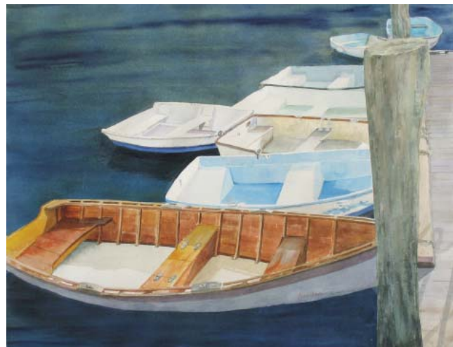
Lynn Wallin, Cotuit Dinghies , 2014, watercolor on paper