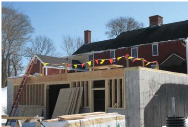
The lower level of the addition has begun to take shape

We are also working on the exhibitions for the gallery spaces in the historic building and the new addition. In the historic building, we plan to have a room reserved for information about the preservation and conservation of the building.