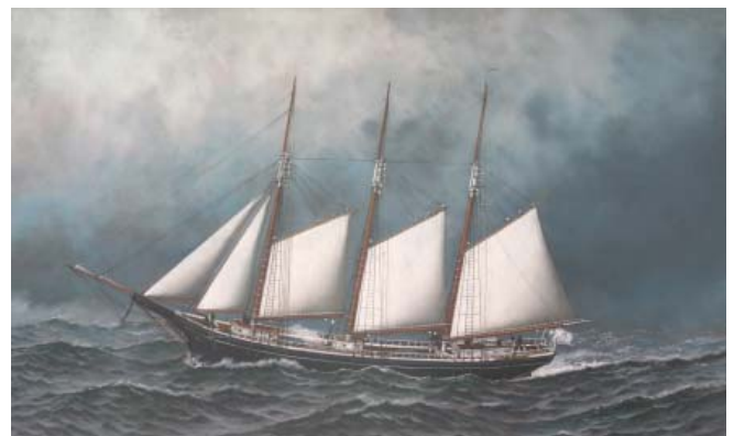
Antonio Jacobsen, Maud Sherwood , 1910, oil on canvas, Permanent Collection of the Martha's Vineyard Museum