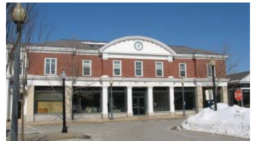
Cahoon Museum's new Temporary Location at 30 Bates Road, at the end of North Market Street (in the old New Balance store.) There is parking and another entrance at the back of the building.

This new space is great for us because it has both a large area for the gift shop and a large area for exhibitions. Rae Bacigalupo, our gift shop coordinator, has done a fabulous job organizing both consignment and regular items in an extremely attractive display. Some highlights in the gift shop