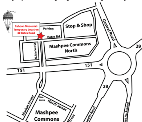
Come join us at our new temporary location at 30 Bates Road in Mashpee Commons North.

The hours of our new temporary location are Tuesday - Saturday 10 a.m. to 4 p.m. and Sunday 1 to 4 p.m. Admission is free. More information may be obtained by calling (508) 428-7581 or rwaterhouse@cahoonmuseum.org .